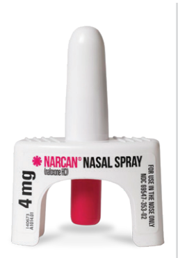
Not actual size.

Signs of an opioid overdose include breathing problems, severe sleepiness, or not responding.