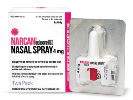
Find more information at NARCAN.com

The medicine in NARCAN® Nasal Spray has no effect in people who are not taking opioid medicines.